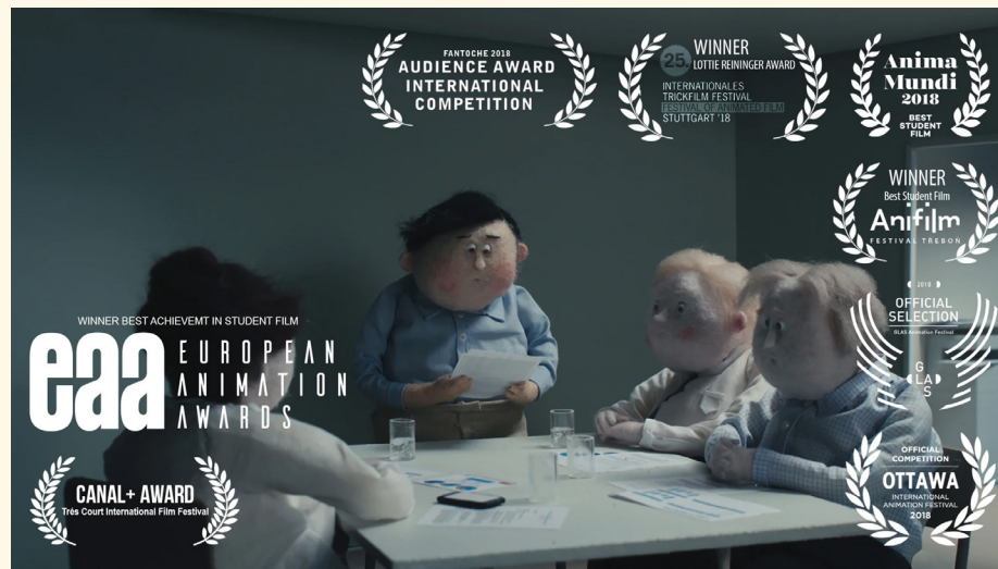
Enough | 2017