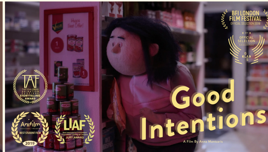
Good Intentions | 2018