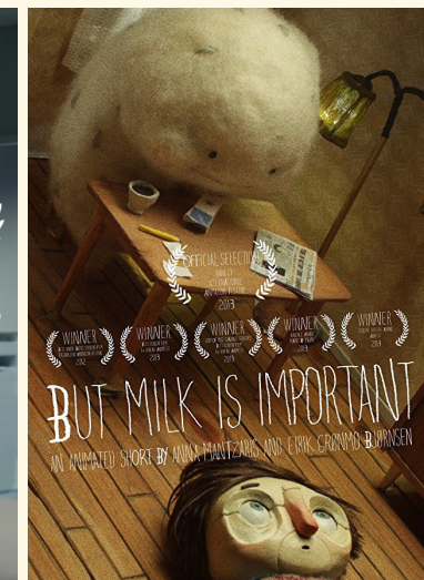
But milk is important | 2012