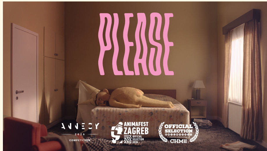
Please | 2026